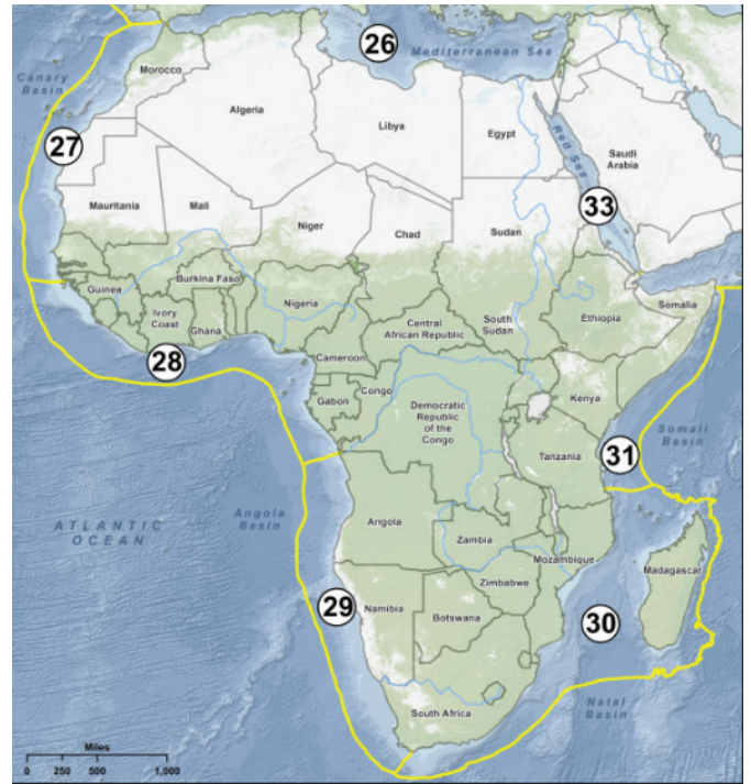
Figure 1. Location of African LMEs: Mediterranean (26), Canary Current (27), Guinea Current (28), Benguela Current (29), Agulhas Current (30), Somali Coastal Current (31) and Red Sea (33). The circled number is as assigned in the World Map of Large Marine Ecosystems (Sherman and Hamukuaya, 2016; Satia, 2016).

Climate change has tremendous impacts on marine biodiversity, such as fish stock abundance, composition, distribution, and availability, in ways that are not yet fully understood and could result in significant ecosystem changes, biodiversity loss or the collapse of major fish stocks. Warmer temperatures are expected to lead to a drop of 21% in the annual landed value of fish in West Africa and a fall of nearly 50% in fisheries-related employment by 2050. Ocean acidification will increase with increasing CO 2 in the Ocean, coupled with increased temperature, which will have profound impacts, especially on