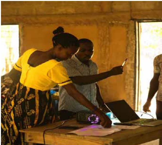
Voting process for the CREMA Executives