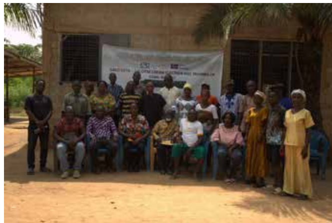
Elected Community Resource Management Committee (CRMC)

The elected executive will converge again for the training working shop towards governance of the CREMA in the coming weeks. Proposed date for this activity is the 1st and 2nd of August, 2023.