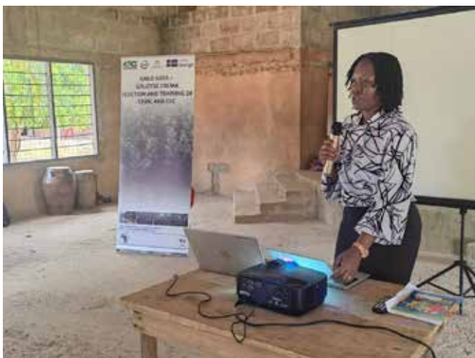
AU-IBAR Gender Expert delivering a speech on behalf of the Director of AU-IBAR