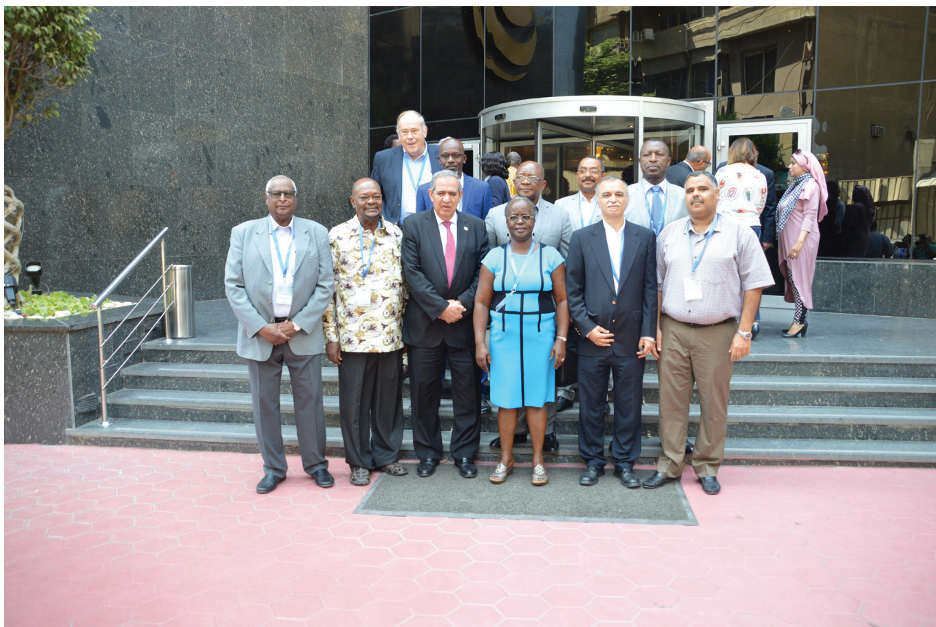
Elected Executive Committee Members of the 2AVSB with the Director of AU-IBAR