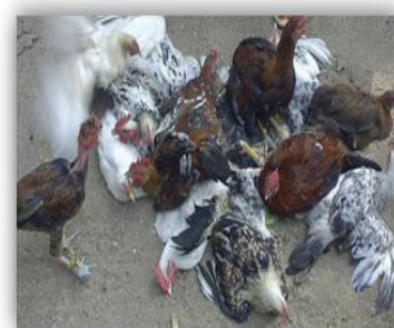
Local poultry breeds, Madagascar