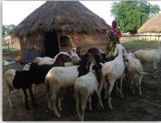
Women presenting her Djallonke sheep herd, Cameroun