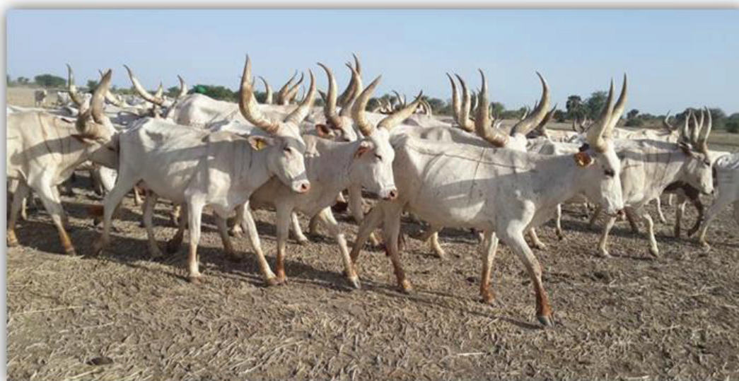
Kuri cattle herd, Chad

In that regard and as articulated by the Global Plan of Action for Animal Genetic Resources and Interlaken Declaration the “area that requires development is the framework for the exchange of animal genetic resources among countries”. Policy development should take into account the increasing role of intellectual property rights in the sector, and the need to secure fair and equitable benefit-sharing, the rights of indigenous and local communities, particularly pastoralists, and the role of their knowledge systems.” 9