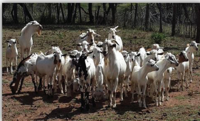
Gala goat herd, Kenya