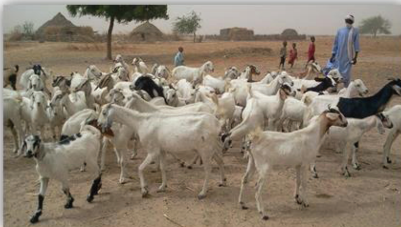
Herd of Sahelian breed of goats with the herder, Chad