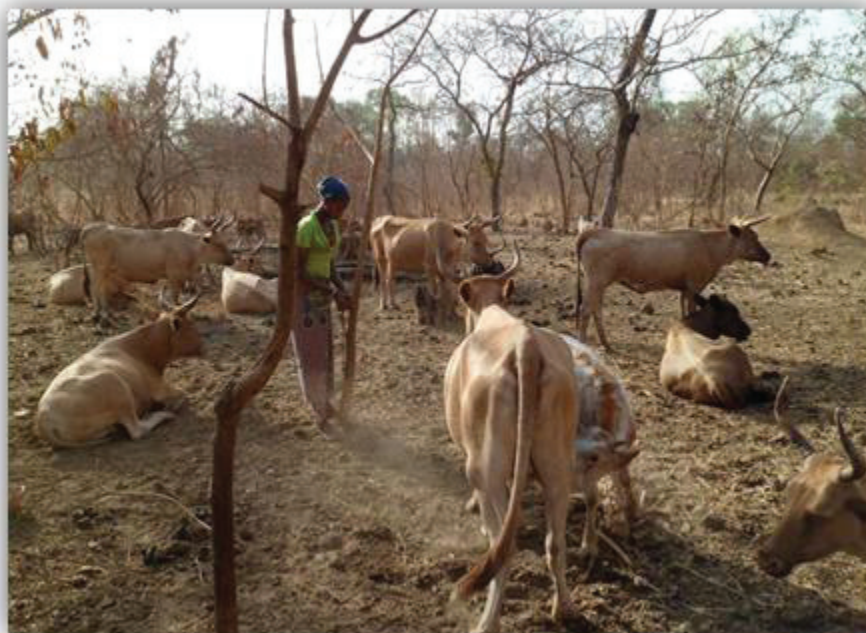
Fulani girl in a N'Dama herd, Guinea

As pointed out in 2.3.b) above, animal identification and systematic recording of performance data are key to demonstrating the potential advantages of African AnGR and stimulating potential user interest in these resources.