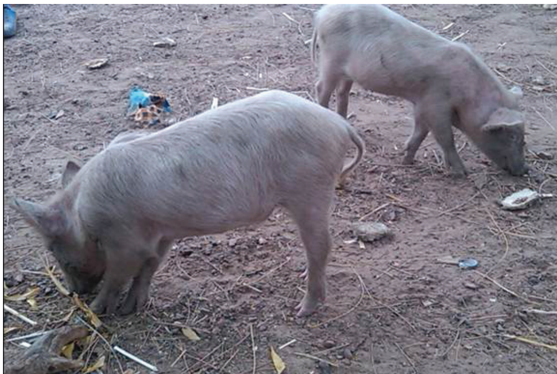
Local pig breed, Burkina Faso