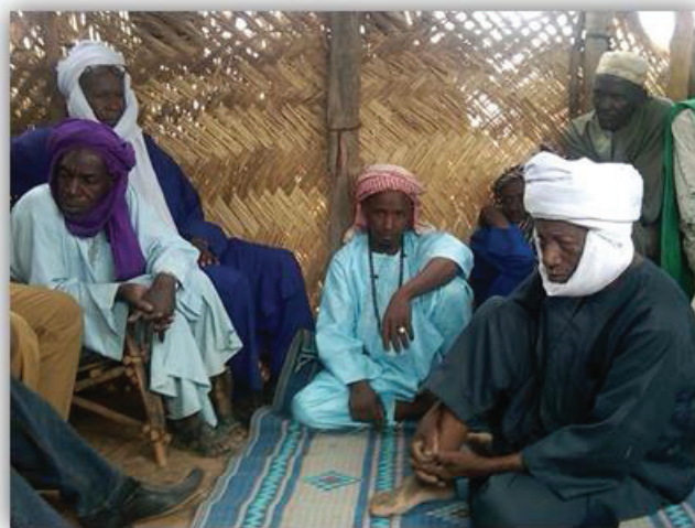
Farmers discussing livestock issues, Niger

Different strategies have been suggested for securing livestock keepers' rights, and these include codifying the customary laws that relate to the management of AnGR. A first step in this direction would be to review relevant customary law in order to identify which principles need to be included. Given that grazing rights are crucial to maintaining pastoral societies and are thus closely linked to conservation both at a breed level and at an allelic level, livestock keepers' rights could include production and grazing rights, as well as the protection of traditional knowledge. Mechanisms to strengthen livestock keepers' understanding of AnGR issues, their negotiation capacity and access to legal support would also necessarily be a crucial element of a strategy for developing livestock keepers' rights.