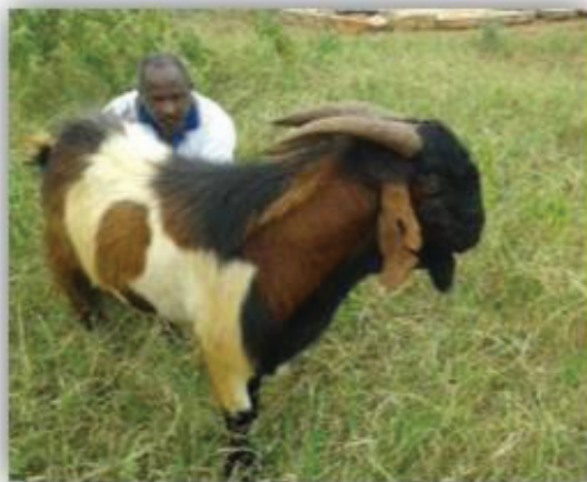
Malia bucks, Tanzania

to develop strategies for their improvement and conservation. 11