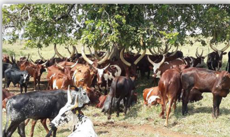
Ankole herd, Uganda

The Government of Rwanda recently adopted key policies namely Vision 2020 and the Poverty Reduction Policy that will foster development for the next 2 decades. One of the pillars of the vision is the transformation from subsistence to a productive, high value, market-oriented Agriculture that acts as a catalyst for further economic development in processing, trade and releasing people from the agricultural sector into other sectors of the economy. Key products for this policy are milk, meat, fish, hides and skins and honey.