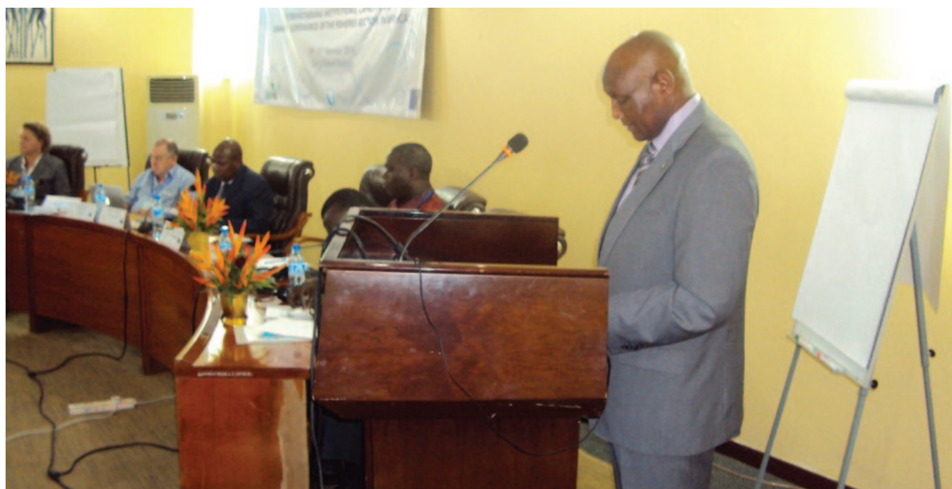
Deputy Minister Honourable Kaika Oletelele

The contribution of the fisheries and aquaculture towards food security, livelihoods and economy is immense globally. Hence the Hon. Deputy Minister urged the participants to learn from the Tanzanian sector during field visits and also advise on the best practises that can be adopted. He highlighted areas that require attention in ensuring good governance and management of the sector such as Illegal, Unregulated and Unreported (IUU) fishing, meeting increasing demand for food fish without compromising the ecosystem etc. He iterated his Ministry commitment in developing the sector and ensuring good governance with species specific management plans in place by engaging all key stakeholders and assuring commitment in implementing policy framework and reform strategy. He officially opened the workshop.