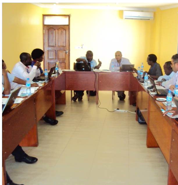
Working group's sessions