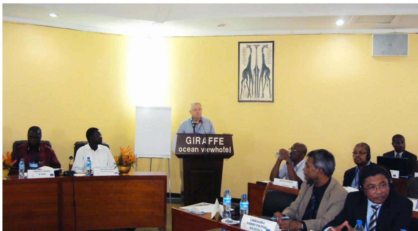
European Union Representative Mr. Dominique Davoux

Mr Davoux noted that in most African countries fisheries and aquaculture is practiced at subsistence levels with minimal value addition to the products. Irrespective of that, the sector remains a means of living for the fisher-folks including women who are particularly involved in fish processing, trade and marketing that are still characterized with a range of problems in the 54 countries of Africa. The project is envisaged to address the management, policy, institutional and governance issues of the fisheries and aquaculture sector in Africa. The project postulates promotion of value-addition and increased protection of the fish stocks as the aquatic ecosystems are experiencing stock decline. The FishGov project is designated to align and harmonise policies and legislative frameworks in order to exercise effective control and enforce compliance. He concluded with the need for appropriate framework to build dynamic relationship between the private and public sector along the whole value chain of fisheries and aquaculture production, this project is aimed to provide through dynamic dialogues, enhanced coordination and coherence in the management of the sector.